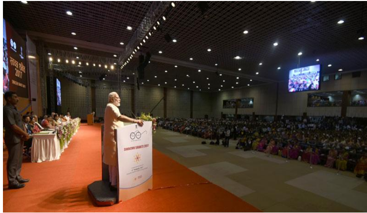
Honble Prime Minister addressing the Women Champions in the Award Ceremony held at Gandhi Mandir, Gandhi Nagar