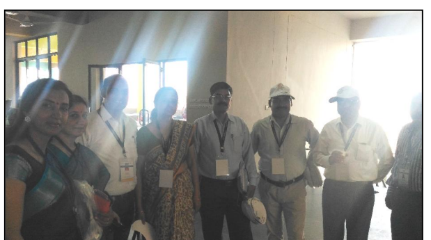
State level Coordinators of Swajal Project

08, US Nagar -09 and Uttarkashi-30, total 207 participants has attended the ceremony.