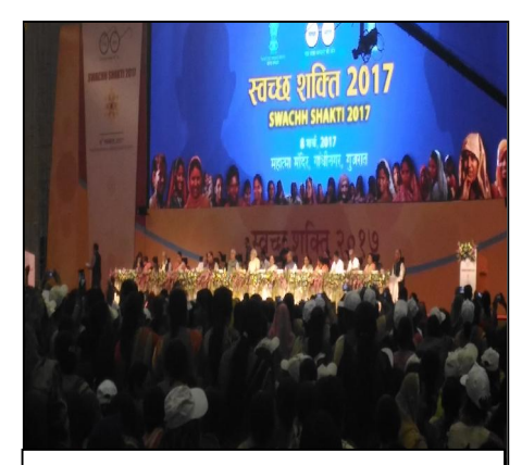
Honble Prime Minister alongwith Honble CM Gujarat in the Award Ceremony

The event aimed to be reminder to all the participants and dignitaries of their commitment to Swachh Bharat Mission, facilitate inter-minsterial capacity buildings as it pertains to SBM action plan, technologies, behavior change, encourage support to the felicitated GPs to ensure ODF sustainability, propagate successful ideas and foster leadership among poor performing districts and encourage a similar event at the state level for GPs to enable cross learning.